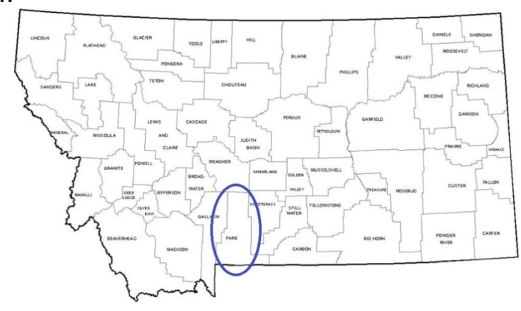
Figure 3. Park County, MT.

Park County as a Hub of Outdoor Recreation: As noted above, 40% of the nights spent in Montana by groups that fished were in Yellowstone Country and the Upper Yellowstone River is a major draw for water based recreation. Many of the activities on the river occur in Park County (Figure 3), home of Livingston, the north entrance to Yellowstone National Park in Gardiner, and the Paradise Valley in-between. In 2014, tourism related industries made up 31% of Park County's total employment. Since 1998, travel and tourism employment has grown by 20.4% (1,210 to 1,457), while employment in all other sectors has grown 10.6% (2,955 to 3,267). A large majority of travel and recreation employment growth is attributable to accommodation and food service industries.<sup>4</sup>